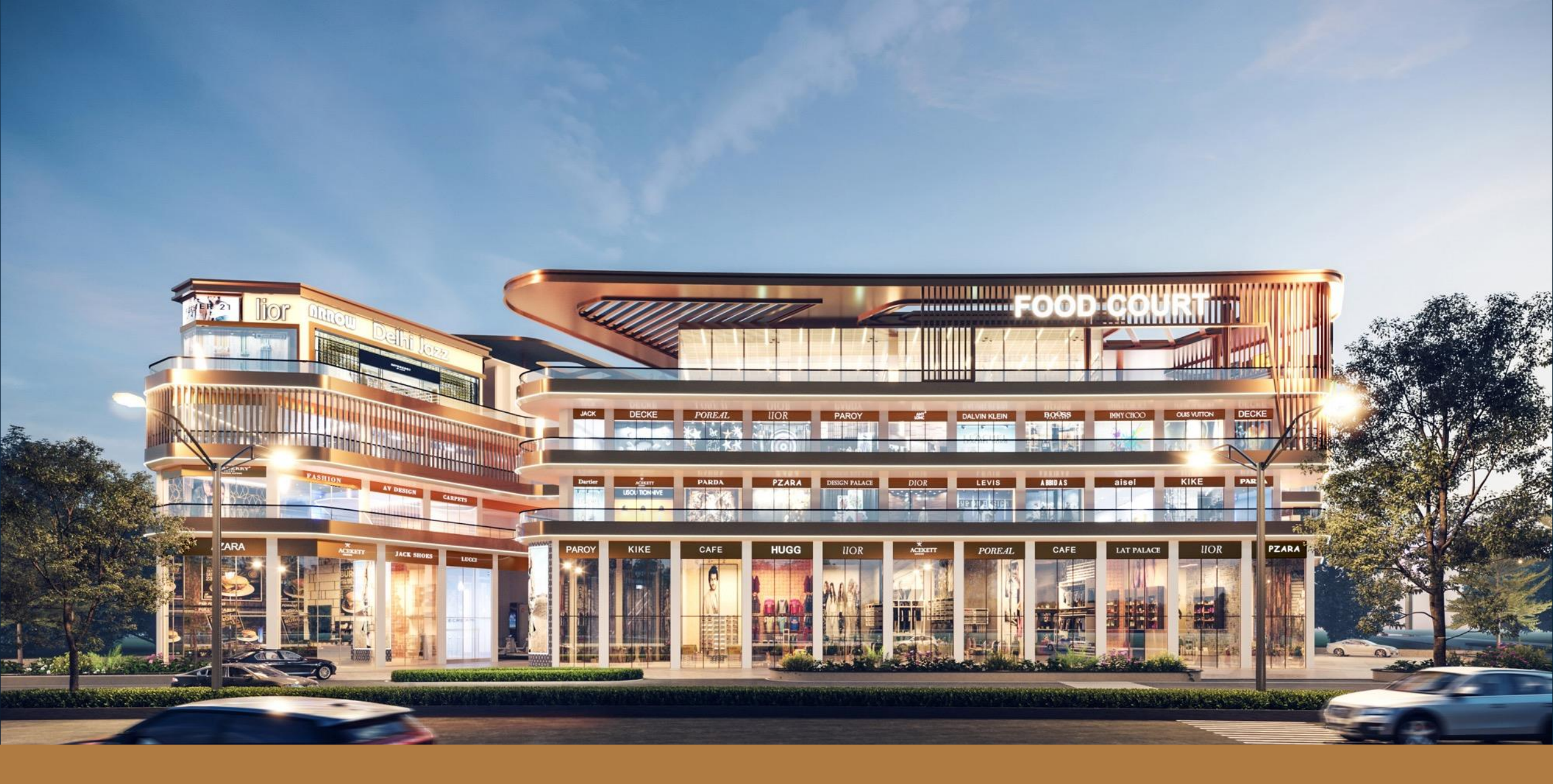
TRIPLE HEIGHT RETAIL SCOs WITH 30' HEIGHT